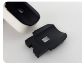
Silicon layer on the SpO2sensor