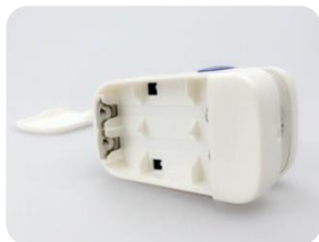
Power : 2*AAA (1.5V)